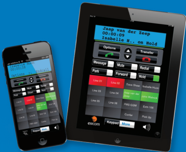
Softphone app on Apple iPhone

The Softphone App is the extension of your company PBX to your smartphone giving you Fixed Mobile Convergence with Hold and Transfer of calls and presence information for colleagues. Enjoy all the benefits of your secure company PBX from your smartphone.