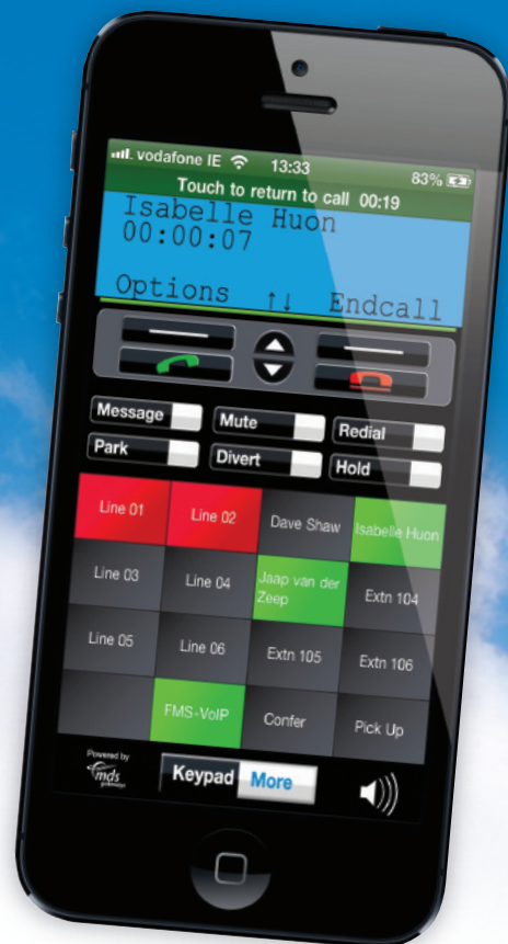
Softphone for iPhone