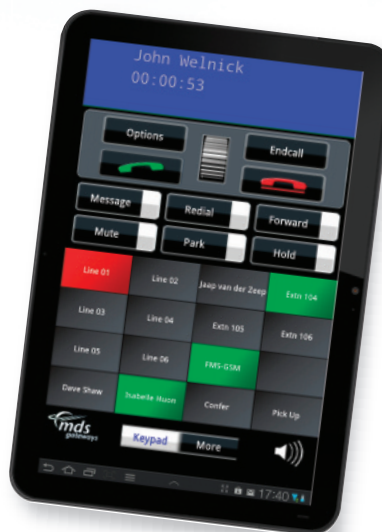
Softphone app on Android tablet