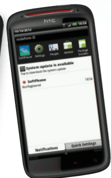
Softphone app registered on Android smartphone