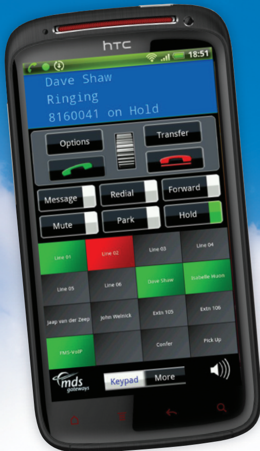
Softphone for Android