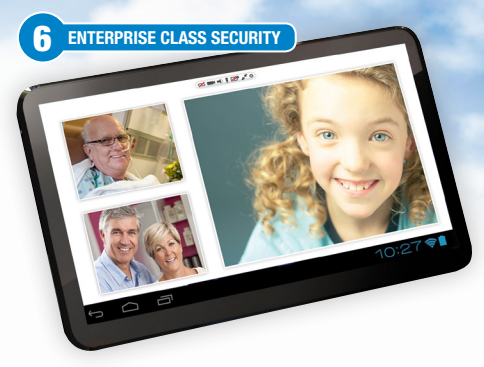
Virtual hospital visits on fully secure video connections